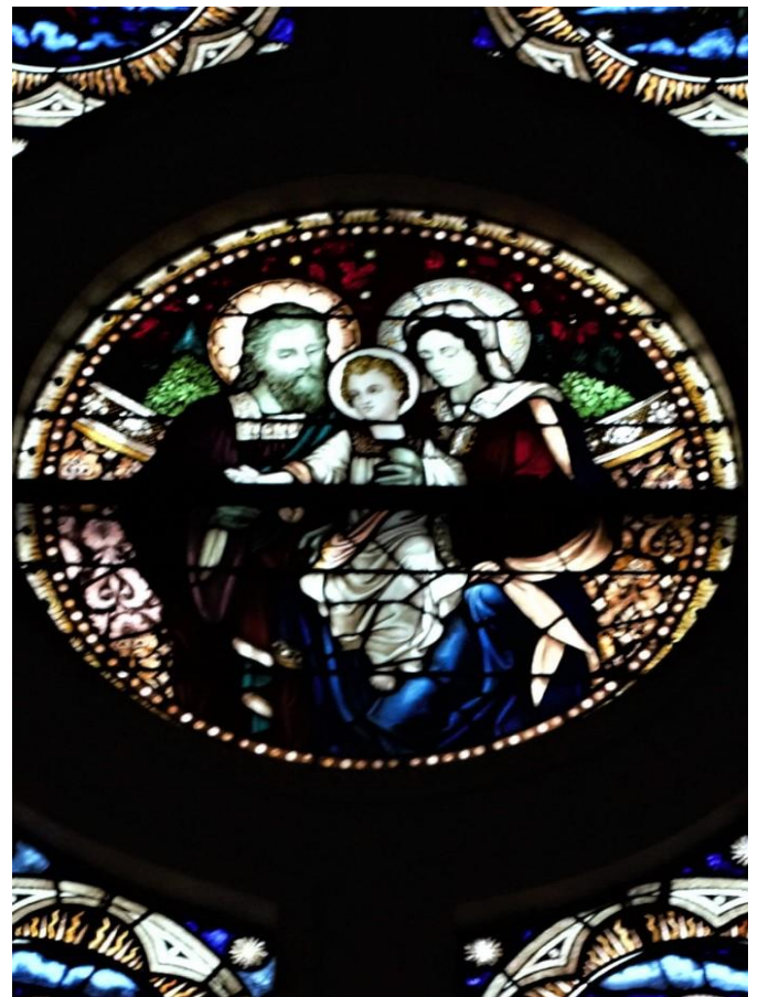
The Holy Family in the western Rose Window St Mary's Church Concord

If you are unwell, please do not come to the church. Any parishioners in a high-risk category are encouraged to stay home. All Catholics are still dispensed from the obligation of attending Sunday Mass.