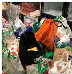
Pictured: a donation to our foodbank. This food will be delivered to people seeking asylum and refugees.

To help, please call (02)9356 3888 or email: jrsreception@jrs.org.au or click the link above this post.