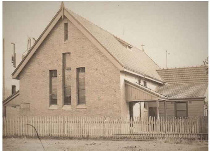
The photo of the 1894 school was taken 1917 as the hall was under construction (on the left).

When the New South Wales Colonial Government withdrew funding for denominational schools in 1879, it became more difficult for the parish to pay the salary of the teacher and to maintain the school.