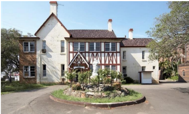
The Presbytery c 2003

When Father McCarthy was appointed parish priest in 1870, he lived in a cottage on the Burwood side of Parramatta Road until the Presbytery (the priest's residence) was built in 1882. It stood on the northern side of the 1874 church facing Burton Street.